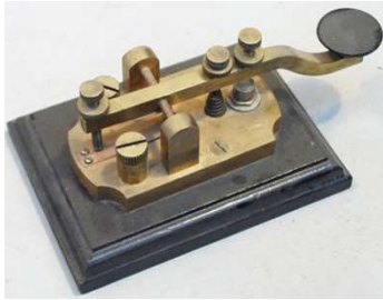
A telegraph machine