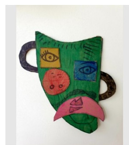
Mixed Emotions Ida, Age 6