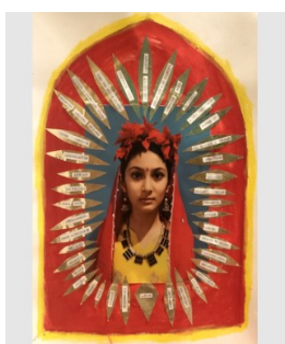
Queen Sophia, Age 10